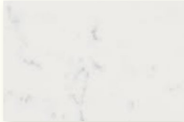
Quartz kitchen & vanities countertops & backsplash