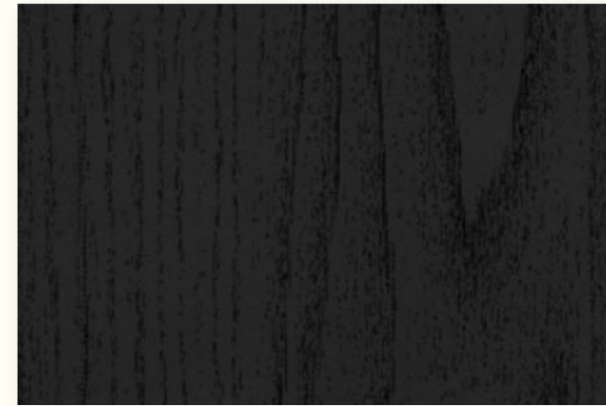
Kitchen millwork islands