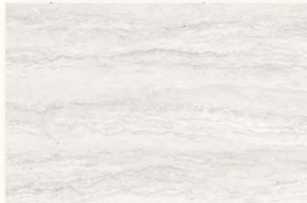
Floor tiles: Washrooms & W/D closets Wall tiles: Shower/bath